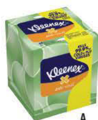
A Proven protection against cold and flu viruses.